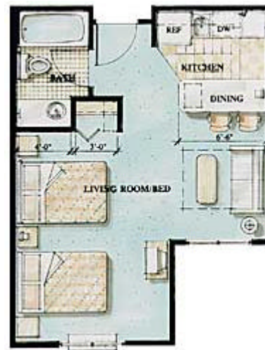
Just another example of a floor plan in the MainStay Suites.

A more complete breakdown of the menu, including the meal reservation forms will be sent out next month.