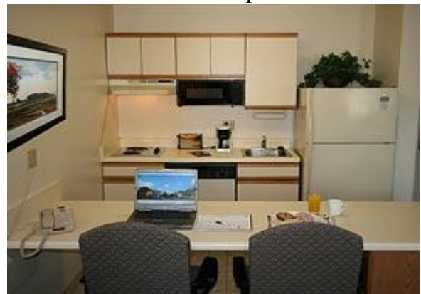
Kitchen area in our of the MainStay Suites.

All the information relating to the sleeping rooms will be included in the same issue; this will be sent in the “Files and Profiles” as well as the district newsletter. We will make every effort to ensure that all our members receive correspondence.