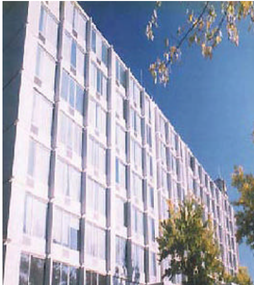
The Alta Vista Hotel is located atop Red Mountain overlooking the city of Birmingham

Alta Vista Hotel and Conference Center 260 Goodwin Crest Drive Birmingham, AL 35209 (205) 290-8000